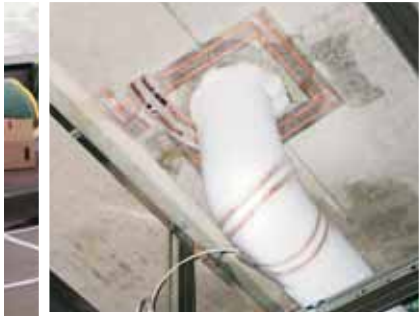
MDT surrounding a roof vent penetration

Each roof grid configuration is customized for specific roof slope, type of deck, and desired resolution of monitoring.